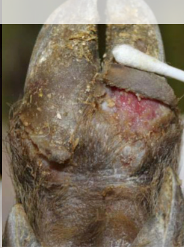
Fig. 4. FMD lesion on the hoof of a wild boar