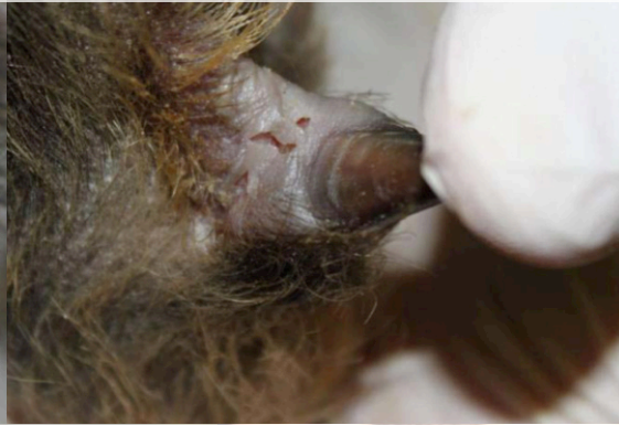
Fig. 2. Vesicle in the interdigital hoof space of a wild boar