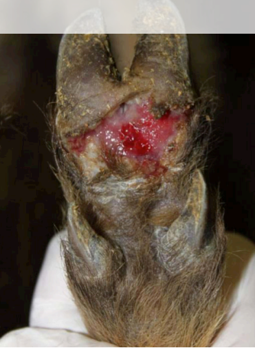
Fig. 3. FMD lesion on the hoof of a wild boar